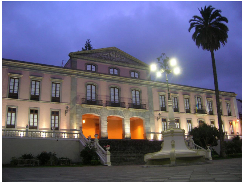
City hall in La Orotava ( point A , meeting point)