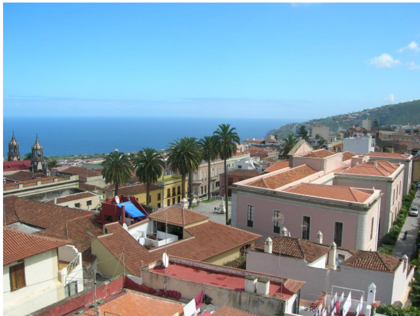
The city hall seen from behind – The street is passing by where the palm trees are